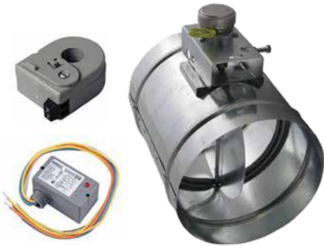
Universal Relay with Current Switch