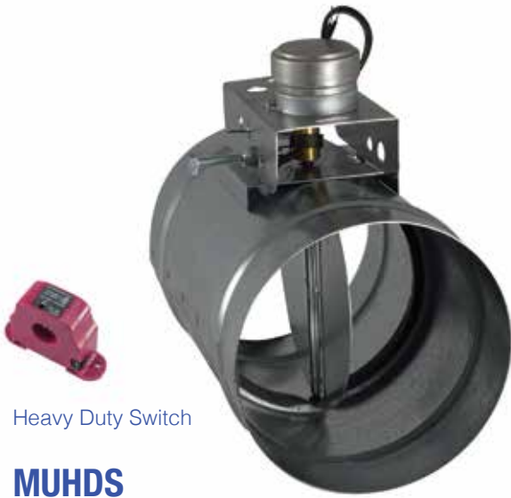
Heavy Duty Switch