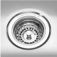
AC09 Basket Waste x 1