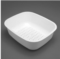
AC02 3/4 Bowl Colander