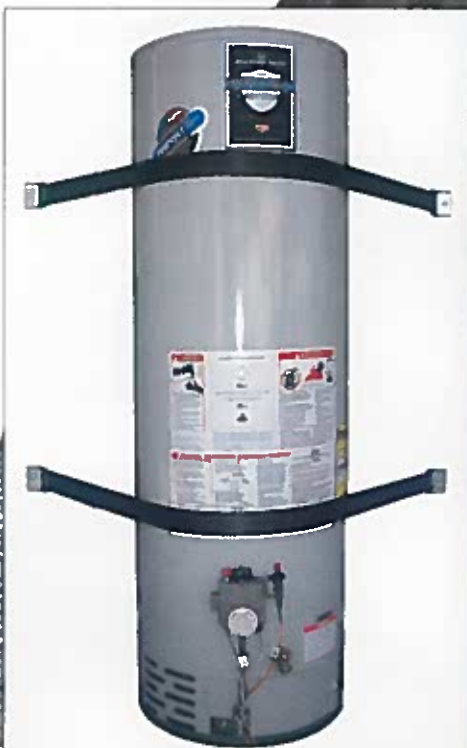
Side Tensioning, SR-80 Shown