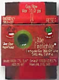
Vertical Gas Safety Valve