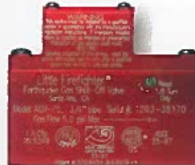
Horizontal Gas Safety Valve