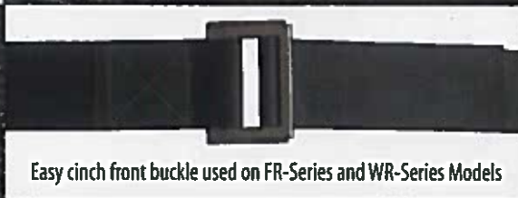
Easy cinch front buckle used on FR-Series and WR-Series Models

California State DSA "Accepted Method" for water heater earthquake bracing. DSA # 001-04 PATENT PENDING