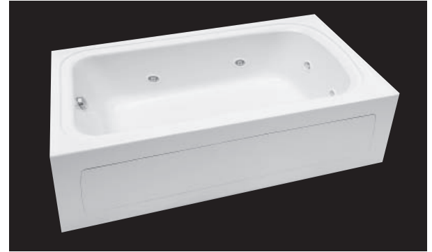
With Integral Skirt