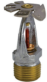
QUICK RESPONSE SERIES GL-QR/SW VERTICAL SIDEWALL