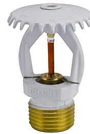
QUICK RESPONSE SERIES GL-QR UPRIGHT