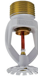
QUICK RESPONSE SERIES GL-QR PENDENT