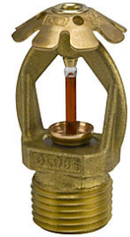
QUICK RESPONSE SERIES GL-QR/CNV CONVENTIONAL