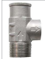
IRV SS Series