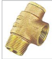
IRV, IRV-NL Series