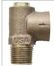
RV, RV-NL Series