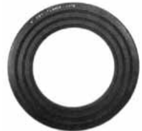
Ring Style Gasket

The RING FLANGE-TYTE® Gasket is compatible with flanges conforming to ANSI/AWWA C115/A21.15 , ANSI/AWWA C110/A21.10 , ASME B16.1 class 125, ANSI/AWWA C207 class B, D, E and F flanges, and ANSI B16.5 in sizes 4"-24".