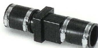
CV200R Check Valve