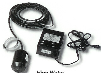
High Water Alarm