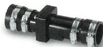
CVSUMPR Check Valve