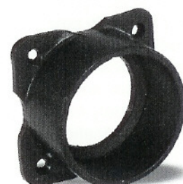
H300C Cast Iron Caulking Hub