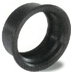
H400R Stop 'n Seal Inlet Hub