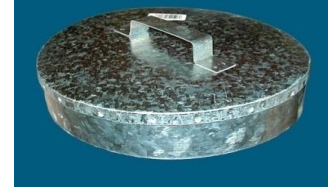
12" Turbine Weather Cap