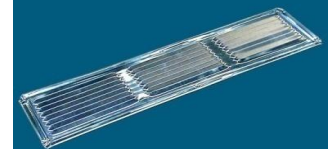
Under Eave Vents