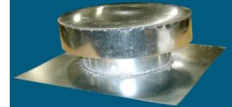
Roof Vents - 12" Round