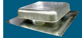
Roof Louvers - 9" Opening