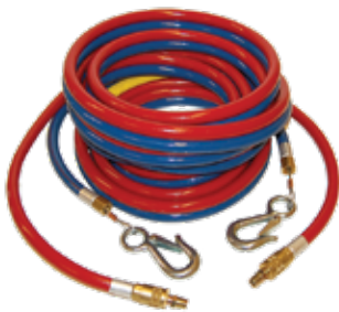
22' Interconnect Hose