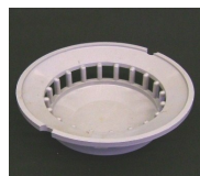
Solid Sediment Bucket