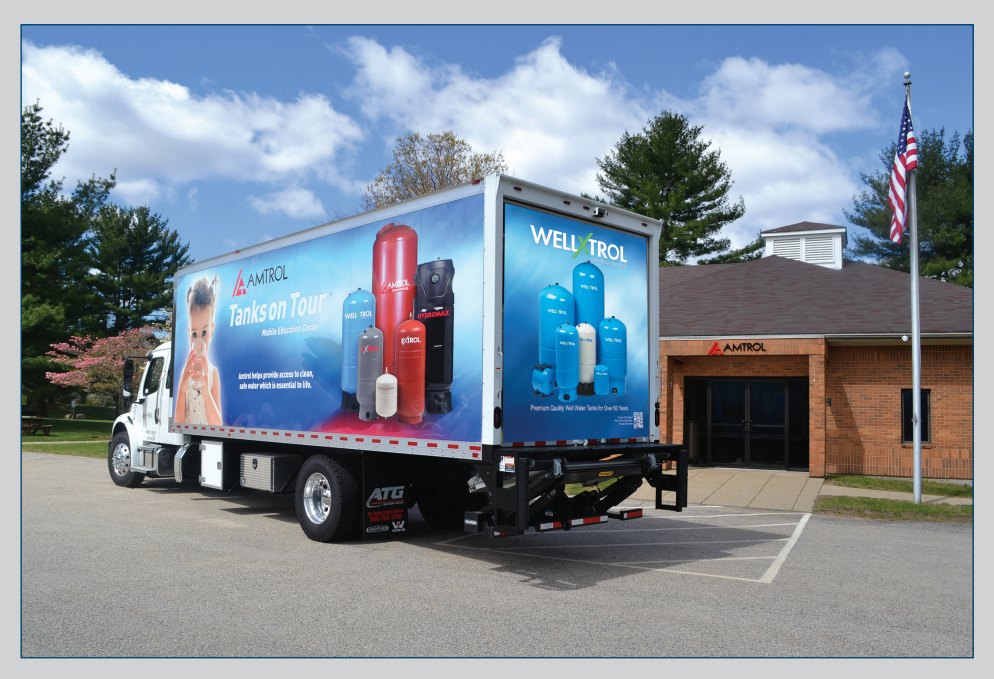
Tanks on Tour™ in front of the Amtrol Education Center.

All models are Amtrol Rewards<sup>™</sup> eligible. Visit amtrolreward.com