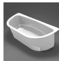
AC72W 'D' Colander