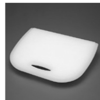
AC24 Synthetic Preparation Board