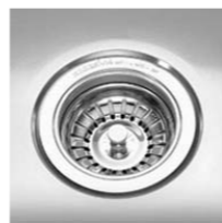
AC09 Basket Waste x 1