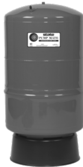
SPMD Series Blue Tank Plastic Base