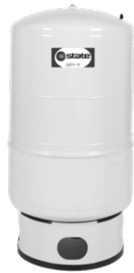
SSB Series Tan Tank Steel Base