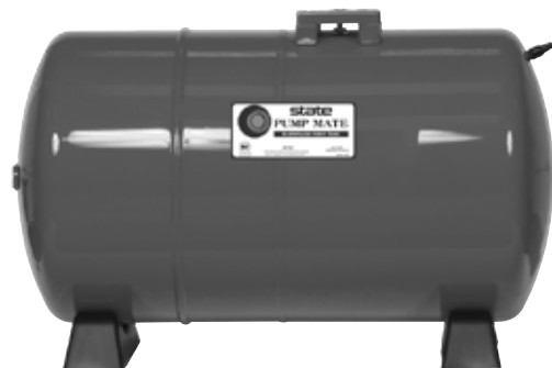
SPMD Series Blue Tank Horizontal