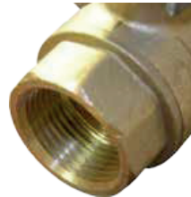
Figure 470 - Threaded End