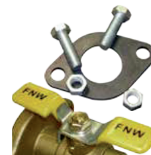
T-Handle, Gasket, & Hardware Included