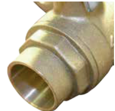
Figure 475 - Sweat End