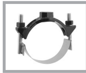
FC101 (epoxy coated with stainless steel band and bolts)