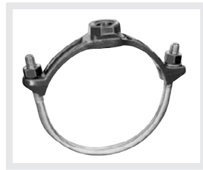
F101 (standard strap)