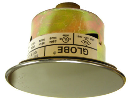
SERIES GL-SR/C CONCEALED PENDENT