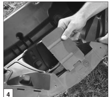
4 Install splash plate.