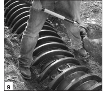
9 Walking-in the fill.

angle and insert the connector hook through the opening on the top of the end cap. Applying firm pressure, lower the end cap to the ground to snap it into place. Do not remove the tear-out seal.