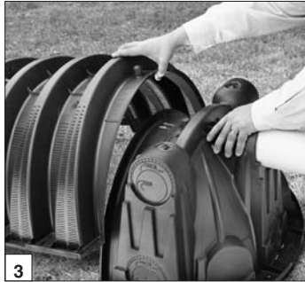
3 Place first chamber onto end cap.

3. Place the inlet end of the first chamber over the back edge of the end cap.