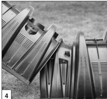
4 Connect the chambers.

4. Lift and place the end of the next chamber onto the previous chamber by holding it at a 90-degree angle. Line up the chamber end between the connector hook and locking pin at the top of the first chamber. Lower to the ground to connect the chambers.