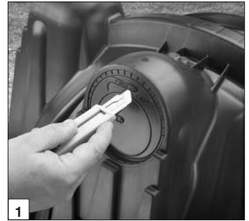
1 Start tear-out seal.