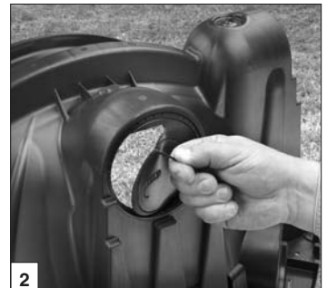
2 Pull tab on tear-out seal.