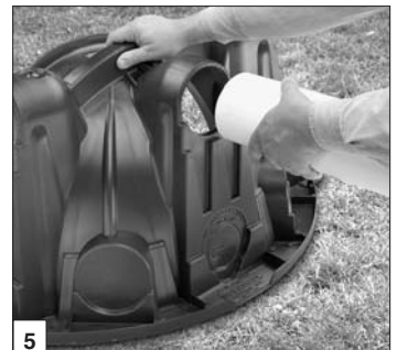
5 Insert inlet pipe.