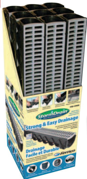
39.5" Channel FSD-CHGG