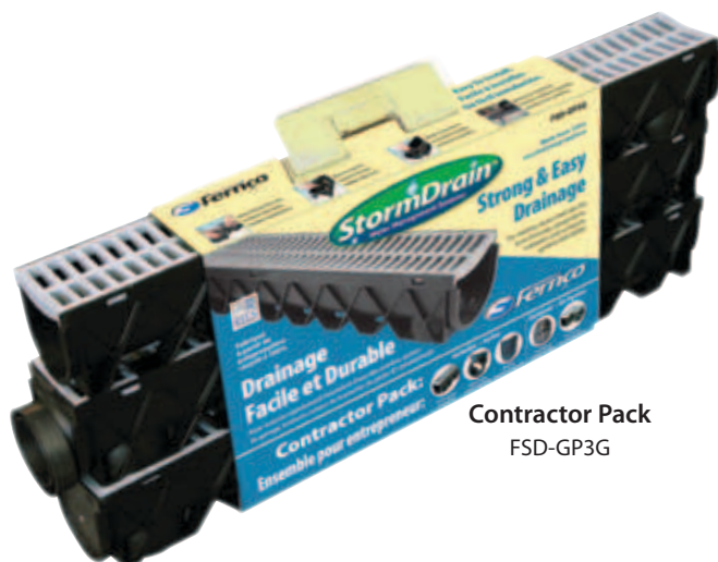
Contractor Pack FSD-GP3G

Walkways - Drains pooling water safely and conveniently.