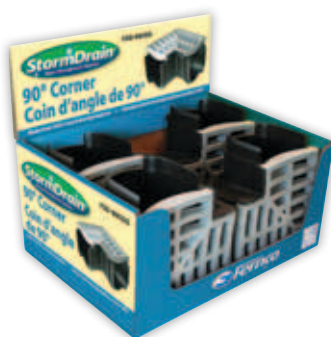
90° Corner FSD-90CGG