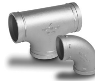
Aluminum Publication 21.03