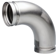
Stainless Steel Publication 17.16