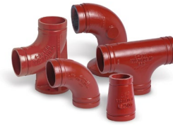
Ductile Iron for AWWA size pipe Publication 23.05