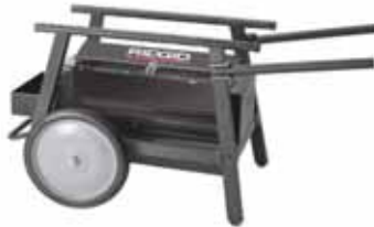
No. 200A with Steel Cabinet