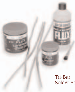
Tri-Bar Solder Sticks