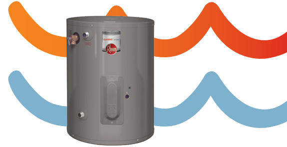
6, 10, 15, 19.9 and 30-Gallon

Professional Classic Point-of-Use 2.5, 6, 10, 15, 19.9 and 30-Gallon Capacities 120 Volt AC 2-Wire Single Phase Electric