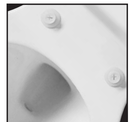
EASY•CLEAN™ LIFTS OFF FOR EASY CLEANING