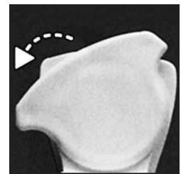
TWIST HINGE TO UNLOCK