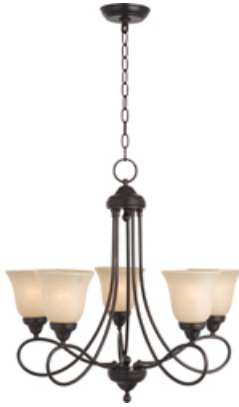
11044WSOI Nova 5-Light Chandelier