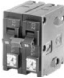
QP 2-Pole Tie Handle ECQTH3