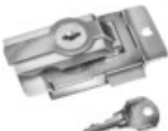
Add-A-Lock (Flush Lock) ECQFL1