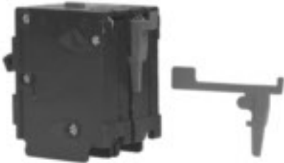
Main Breaker Retainer Kit for EQ Load Centers ECMBR1