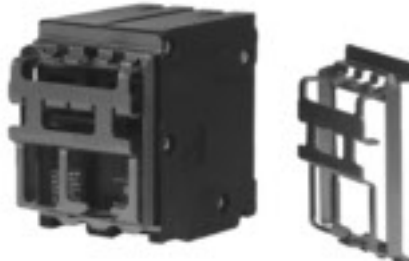
Padlocking Device ECPLD2