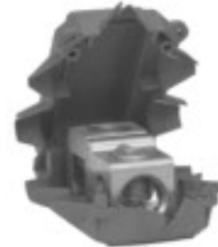
Riser Lug Kit ECRLK250