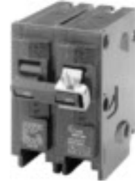
Handle Blocking (Lock Off) Device, ECQL1