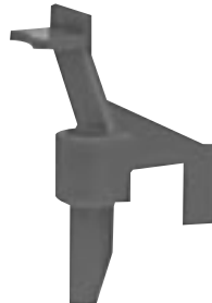
Main Breaker Retainer kit for Ultimate Load Centers ECMBR2