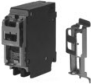
Padlocking Device ECPLD1