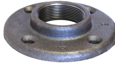
Fig. 1190 Ductile Iron Floor Flange (Class 150 Standard)

For additional sizes larger than 2" (50 DN) see Cast Iron page 52. Not to be used for pressure service. Supplied in steel only. See first page for pressure-temperature ratings. Galvanized weights may vary. Please contact your ASC Engineered Solutions™ Representative if you need verification. All elbows and tees ¾" (10 DN) and larger are 100% gas tested at a minimum of 100 PSI (6.9 bar).