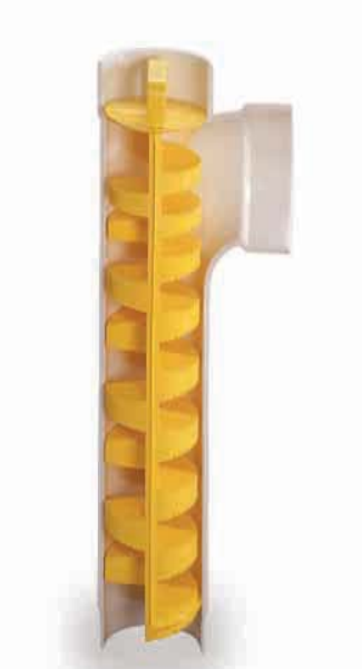
Effluent filters available in 4" (shown) and 6" diameters.