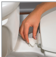
TWIST HINGES TO UNLOCK