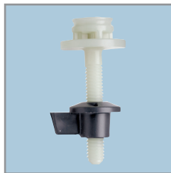
NON-CORROSIVE BOLTS AND WING NUTS