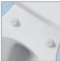
EASY REMOVAL OF SEAT FOR THOROUGH CLEANING