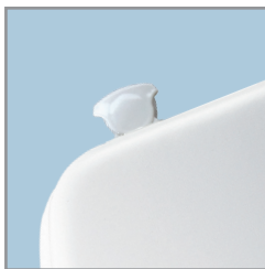
PLASTIC EASY•CLEAN & CHANGE® HINGES