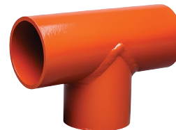
Plain End Publication 14.04