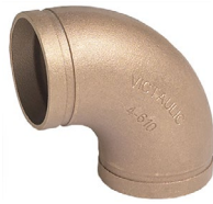
Copper Publication 22.04