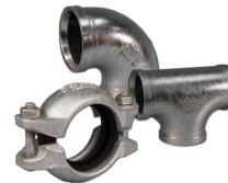
Shouldered Ends Publication 07.06