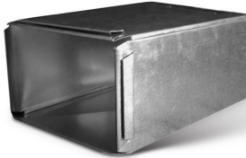
INTEGRATED THOR LOCK