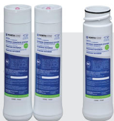
Pre- & Post-Filter NSROPF