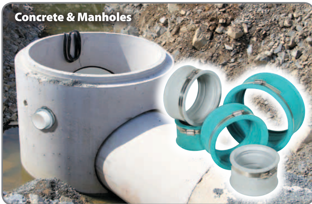
Concrete & Manholes