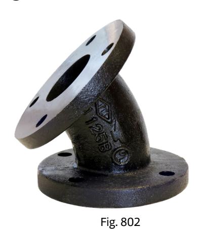
Fig. 802 45° Flanged Elbow