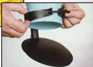
Optional Gas Baffle for EF-4 for extended filter life.