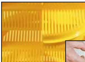
Rear of EF-4 filter - close-up.

Patent Numbers 6,319,403; D 431,629; other pats. pending.