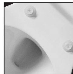
EASY•CLEAN™ LIFTS OFF FOR EASY CLEANING