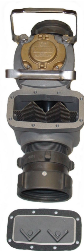
Large Built-in Strainer