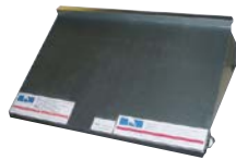
Galvanized cover PN: 960000