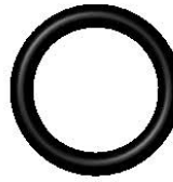
001074-45 O-Ring (Qty 1)