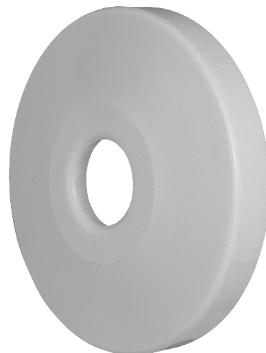
TRIM TITE™ 920-2W shown