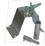
Optional Damper Extension Kit 1-1/2" or 2" H