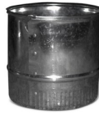
Spin-In No Damper