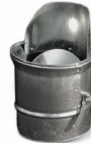
Spin-In Damper & Scoop