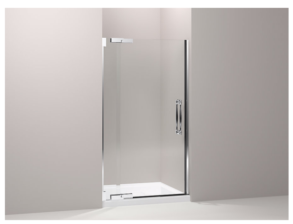
Codes/Standards ANSI Z97.1 (Tempered Glass) CPSC 16CFR 1201

KOHLER® One-Year Limited Warranty See website for detailed warranty information.