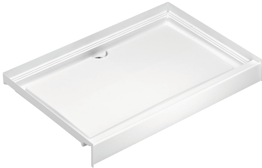
Shown with optional brass drain assembly.