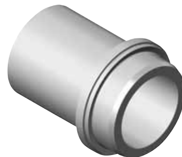
DIPS TO DIPS MJ ADAPTER DIMENSIONS

Beveled for Butterfly Valves available on request. Standard 45° bevel unless otherwise specified by customer.