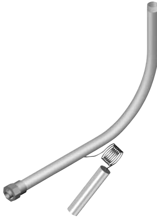
COMPRESSION RISERS w/ANODES