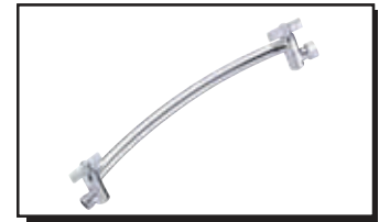
D481170 - 13" adjustable curved high flow shower arm