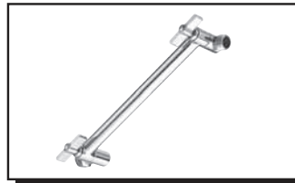
D481150 - 9" adjustable high flow shower arm

Danze products are covered by a manufacturer's limited "lifetime" warranty for manufacturing defects.