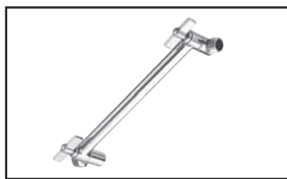
D481150 - 9" adjustable high flow shower arm

Danze products are covered by a manufacturer's limited "lifetime" warranty for manufacturing defects.