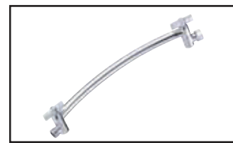
D481170 - 13" adjustable curved high flow shower arm