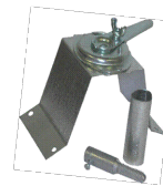
Optional Damper Extension Kit 2" H