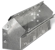
SX23 VERT ANGLE