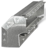
SX21 VERT ELBOW