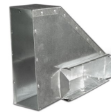
SX24 RE- VERSE EL-