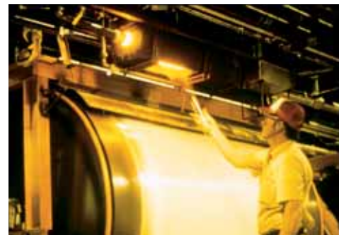
Continuous filament glass fibers are drawn from a furnace onto a revolving drum to form a dense, interlaced mat.

The chipboard filter frame, free of sharp edges, makes the panel easy to install and remove. After removal, the filter can be safely folded for compact disposal.